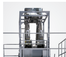
Intelligent Electronic Weigh Filler