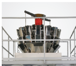
Multi-head Weigh Filler