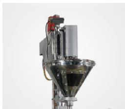
Servo Auger Filler